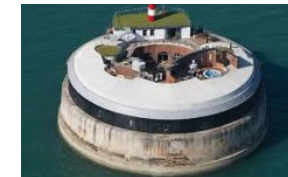
SPIT BANK FORT