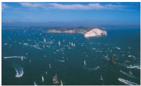
ISLE OF WIGHT