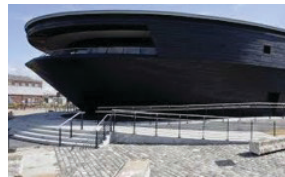
MARY ROSE MUSEUM

Look out of the window and see if you can find the following. Are they in the north, south, east or west windows? Do you think that these things are man made or natural?